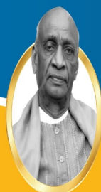
Sardar Vallabhbhai Patel

The CVM University, an equal opportunity institution, pursues excellence in Education and Research in a conducive environment which is culturally rich with a legacy of eminence in building character and strength of mind while standing for sustainability.